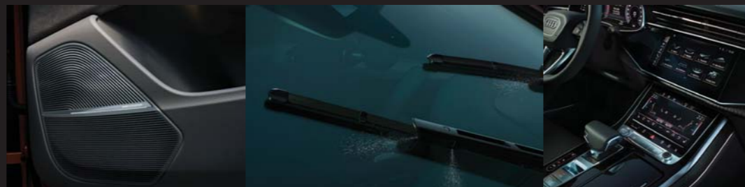
Bang & Olufsen 3D Advanced Sound System

The models and equipment versions illustrated and described in this brochure and some of the services listed are not available in all countries. Some of the cars illustrated are equipped with optional features for which an extra charge is made. Details concerning the delivery specifications, appearance, performance, dimensions and weights, fuels consumption and running costs of the vehicle were correct to the best of our knowledge at the time of going to press. Deviations from the colours and shapes shown in the illustrations many occur. No liability is accepted for errors and printing errors. The right to introduce modifications is reserved.