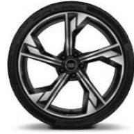
Forged alloy wheels, 5-arm flag style, Glossy Anthracite Black, diamond-turned, 9J x 20