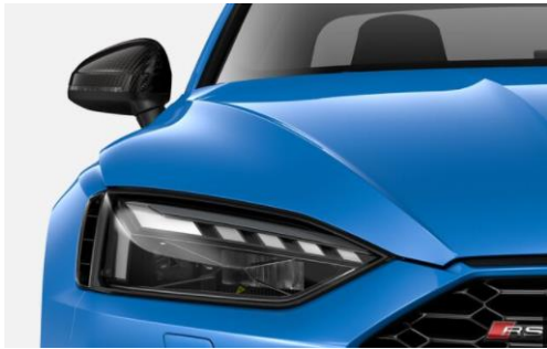
Matrix LED headlamps with Audi laser light, dynamic lighting scheme and dynamic turn signal