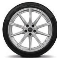
Forged alloy wheels, 10-spoke star, 9J x 19 (standard)