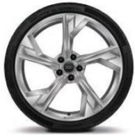
Forged alloy wheels, 5-arm flag style, 9J x 20