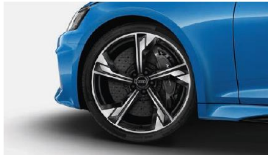
RS ceramic brakes with brake calipers in Anthracite Gray